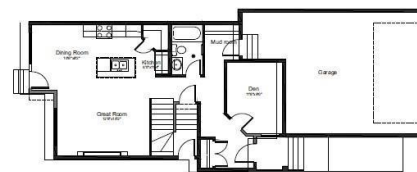
Main Floor Plan 824 sq. ft.

▶ 26' Pocket Two Story Legal Basement Suite (optional) (1 or 2 bedroom options available)